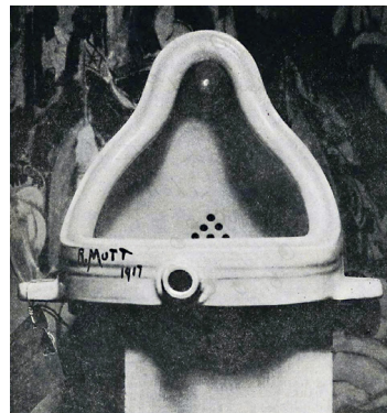
Figure 1. Fountain by Marcel Duchamp, 1917

Meanwhile, outside the realm of cinema, Rosalind Krauss has pointed to Marcel Duchamp’s use of the readymade as an index [33].